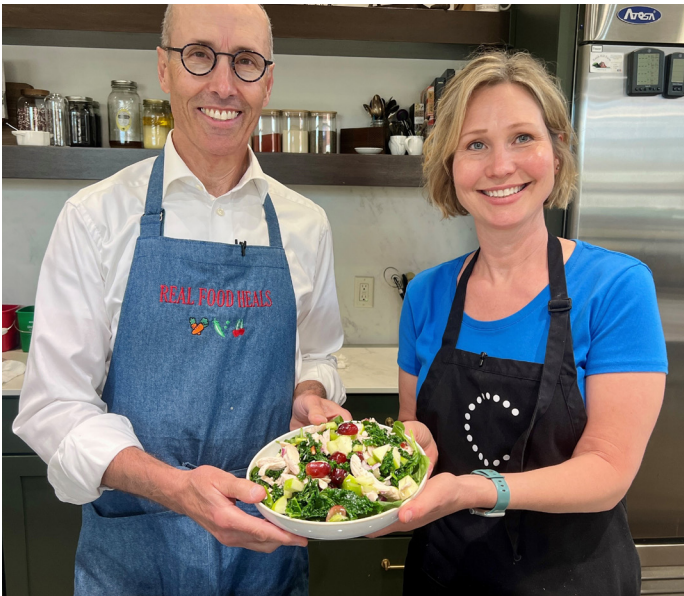
Meals that Matter

The John Stoddard Cancer Center launched Meals that Matter in 2020 to help reduce hunger and increase access to quick, ready-made, nutritionally dense meals that are free of cost for patients and their caregivers. Recognizing the vital role nutrition plays in treatment and recovery, Meals That Matter provides healthy, balanced meals twice a week to patients receiving cancer care, easing both nutritional and financial strain during one of life's most difficult times.