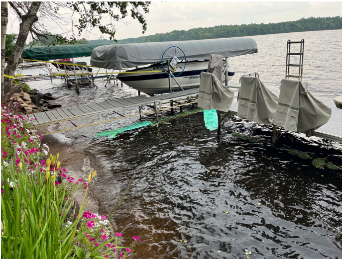
Photo courtesy of OWOS – Integrated Nutrient, Organic Load, and Environmental Exposure Reduction Program for Cancer Prevention

OWOS improves cancer prevention by removing or reducing contaminants linked to carcinogenic mechanisms. One example of how OWOS enforces contaminant reduction is through intercepting nitrates from stormwater, tile drainage, agricultural runoff, and urban corridors before they reach drinking water sources. In addition, OWOS integrates six synergistic solution lines: Flo-Water, AquaFlex, BioFlex, Natura Solve, 42Biochar (Biochar Platform), and BioStar (Chitosan & Treatment Enhancements).