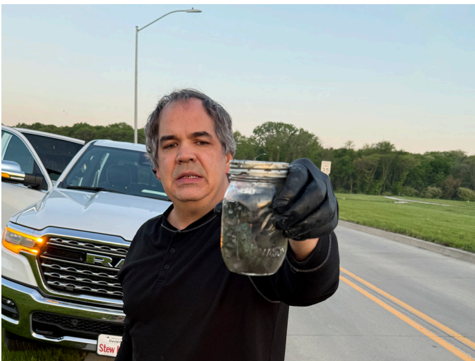
Photo courtesy of OWOS – Integrated Nutrient, Organic Load, and Environmental Exposure Reduction Program for Cancer Prevention

OWOS improves cancer prevention by removing or reducing contaminants linked to carcinogenic mechanisms. One example of how OWOS enforces contaminant reduction is through intercepting nitrates from stormwater, tile drainage, agricultural runoff, and urban corridors before they reach drinking water sources. In addition, OWOS integrates six synergistic solution lines: Flo-Water, AquaFlex, BioFlex, Natura Solve, 42Biochar (Biochar Platform), and BioStar (Chitosan & Treatment Enhancements).